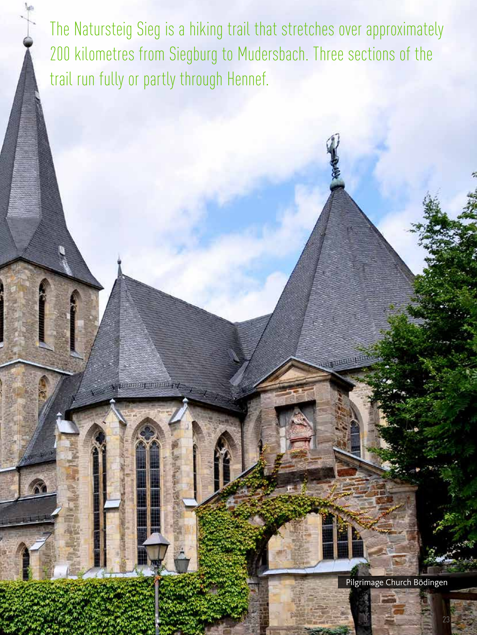
Pilgrimage Church Bödingen

The Natursteig Sieg is a hiking trail that stretches over approximately 200 kilometres from Siegburg to Mudersbach. Three sections of the trail run fully or partly through Hennef.