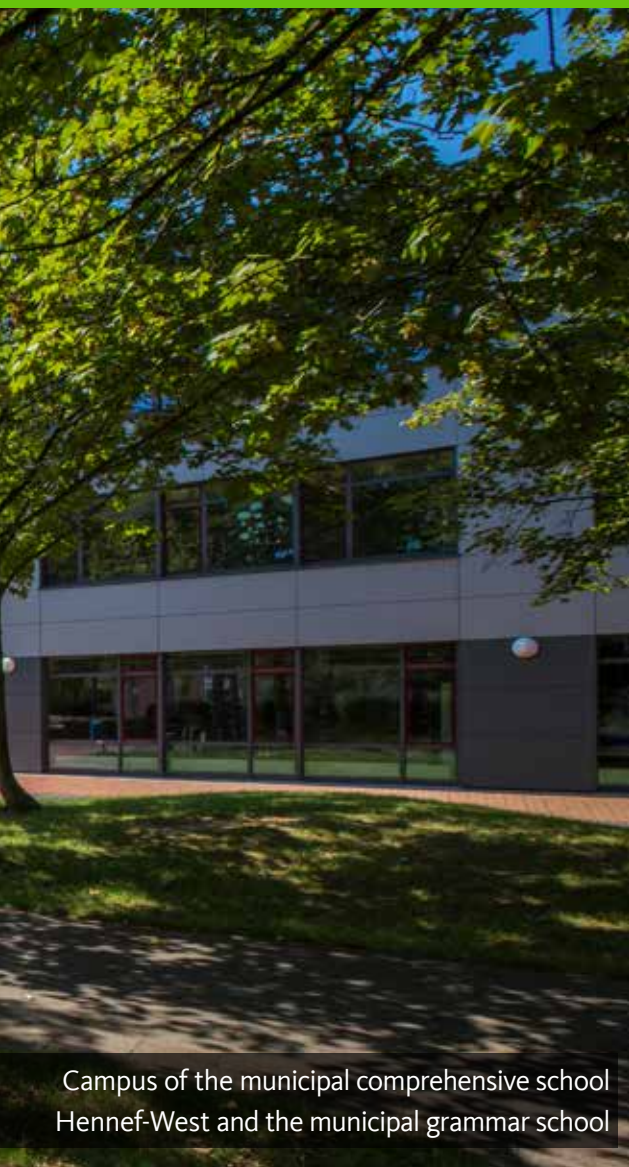
Campus of the municipal comprehensive school Hennef-West and the municipal grammar school

The city is served by eight primary schools, all of which offer all-day schooling. There are also two municipal comprehensive schools (Gesamtschule), one private comprehensive school specialising in art, and a municipal grammar school (Gymnasium).