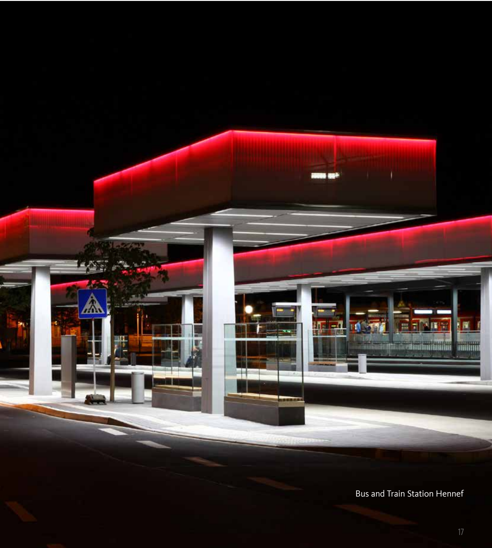
Bus and Train Station Hennef