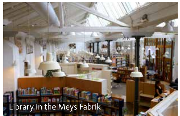
Library in the Meys Fabrik

The city's music school has trained many hundreds of students since it was founded over 65 years ago. Some have even used their training here