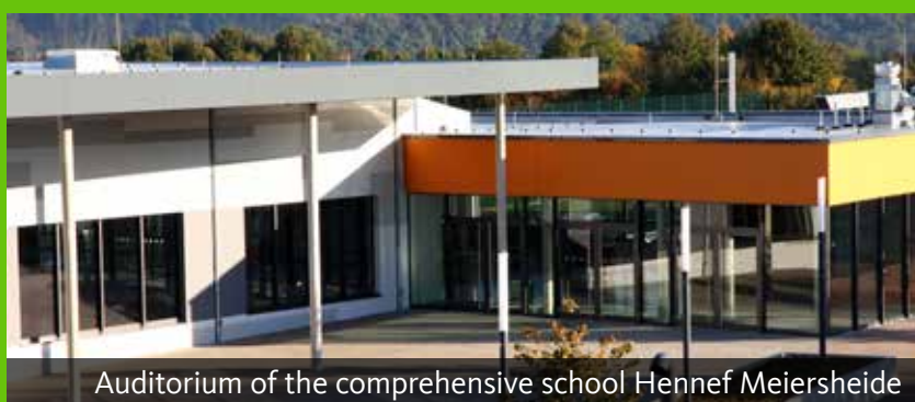
Auditorium of the comprehensive school Hennef Meiersheide