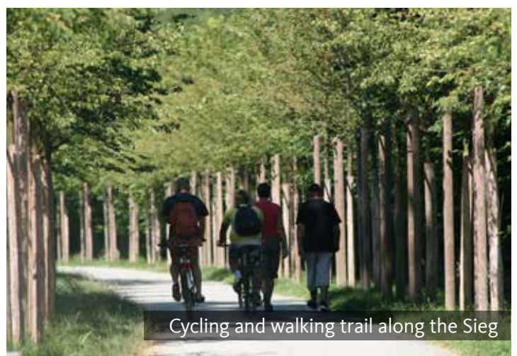
Cycling and walking trail along the Sieg