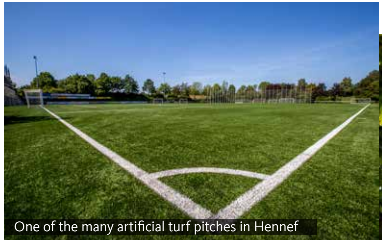
One of the many artificial turf pitches in Hennef

The city implements all sports projects in close collaboration with the StadtSportVerband, the umbrella organisation for sports clubs in Hennef. The organisation has had a major say in planning sports facilities in the town since the Pact for Sport was concluded in 2005. In short, the oft-used phrase „Hennef – City of Sport“ is more than just a slogan. This can be clearly seen in the annual awards for successful athletes, where over 450 sportsmen and women have been honoured in some years. It is also reflected in the children's sport festival, which has been held on the marketplace in Hennef on the first Saturday after the summer holidays since 2005. From morning until evening, over 3,000 children have the chance to try out the activities offered by Hennef's sports clubs from vaulting to tennis.