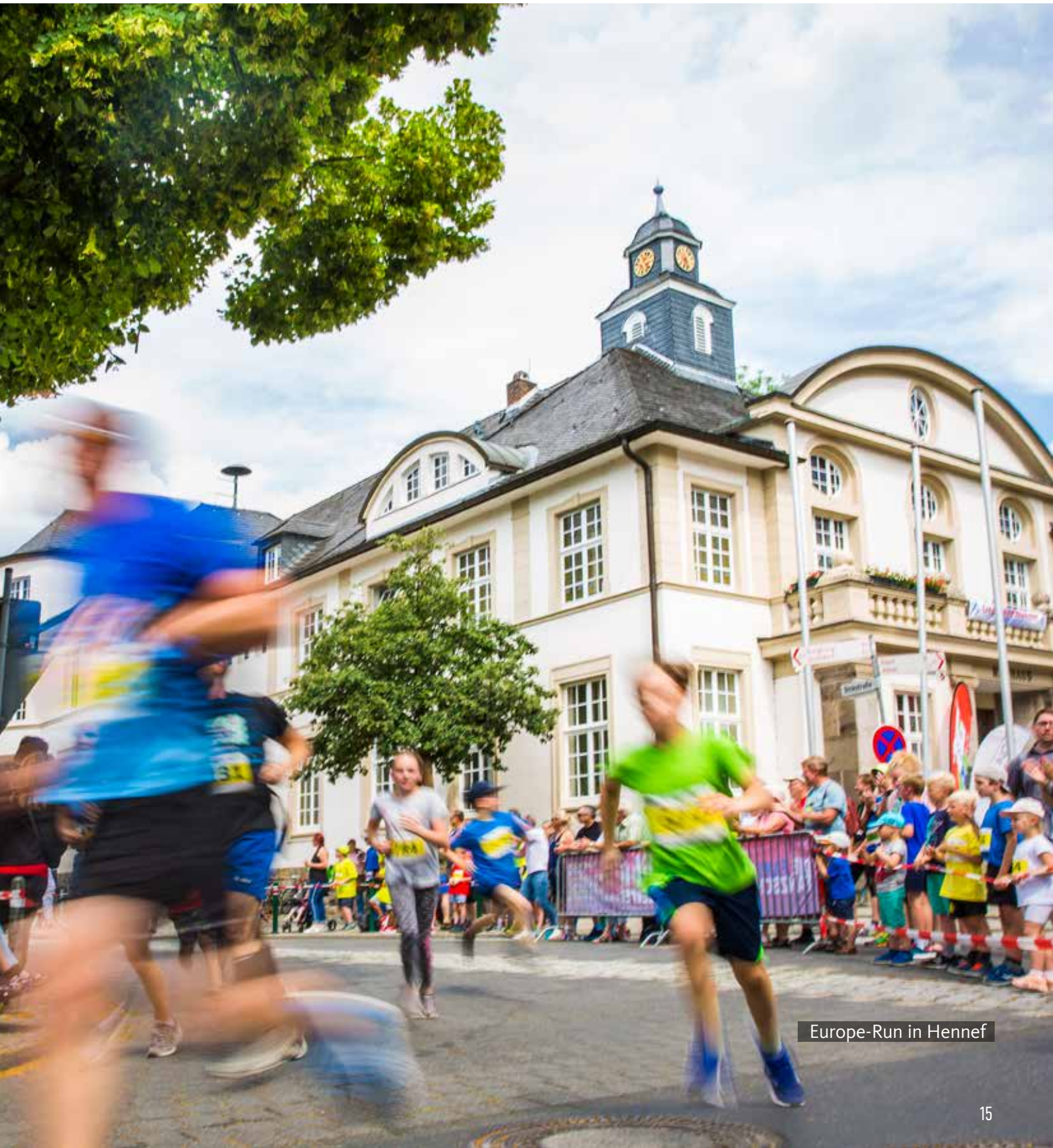
Europe-Run in Hennef