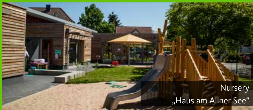
Nursery „Haus am Allner See“